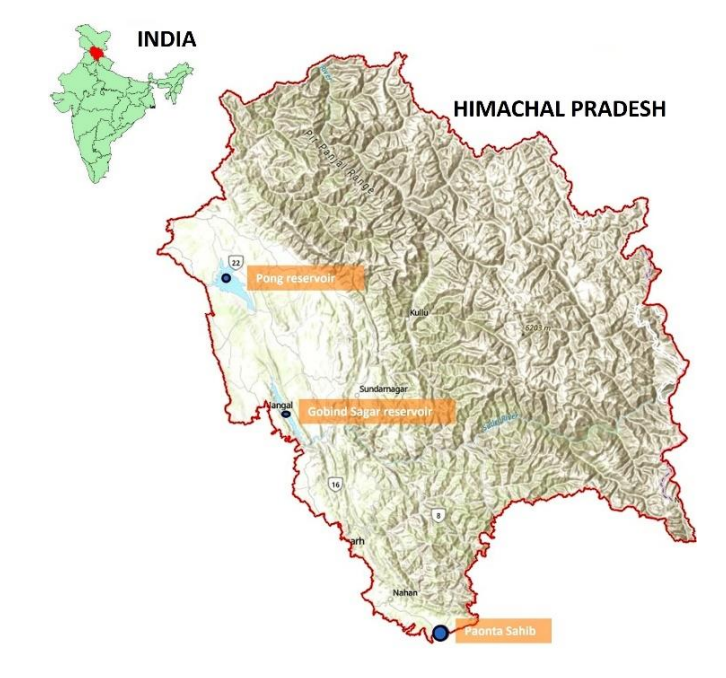
Fig.1. Map showing sampling sites of the present study.

DNA extraction and purification: DNA extraction was done by using Fast DNA<sup>TM</sup> Spin Kit for Soil (MP Biomedicals) with minor modifications. The muscle tissue samples were cut into small pieces and mixed